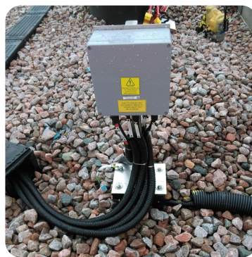
GrayBar Points Heating Junction Box

GrayBar offer design, production and supply of track heating systems, enclosures and accessories for the rail industry.