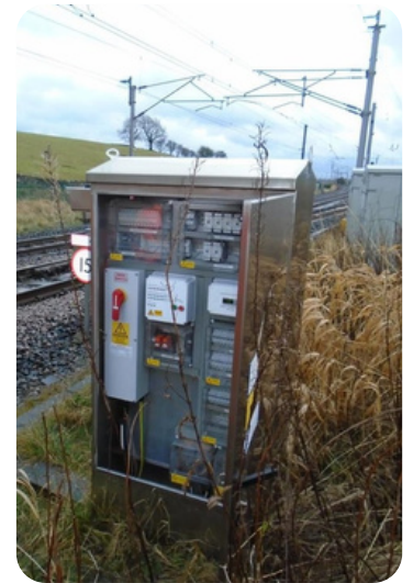
Harrison Sidings - GrayBar Self Regulating Point Heating

Our system is the perfect solution for locations such as these, along with depots and station areas where space is at a premium.